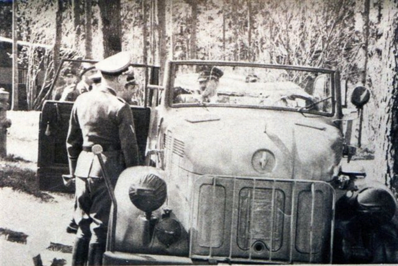
Late spring 1942. View is westward on the main Sperrkreis I road from south of Kasino I. The east side of No. 13 is in the left background. Hitler examines a new model of cross-country personnel carrier with SS-Sturmbannfuehrer Erich Kempka (face in profile), his chief chauffeur.